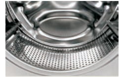
Stainless Steel Component