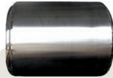
Stainless Steel tank