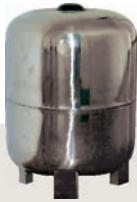
Vertical Pressure Tank